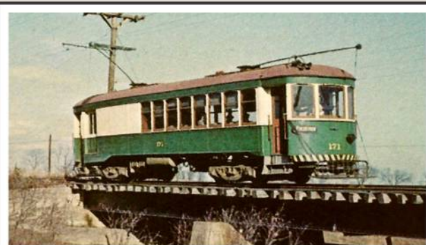
Brill interurban combine 171 near Lewistown. This car was constructed in 1919 and was one of the last trolley cars to operate on the H&F Railway in 1954.

From 1896 when the first trolleys traveled the streets of each city until 1954 when the last trolley departed Frederick for Thurmont, the H&F trolleys were a beloved sight to area residents. The line provided a vital link for the area’s farmers, merchants, and residents in a time before paved roads were common.