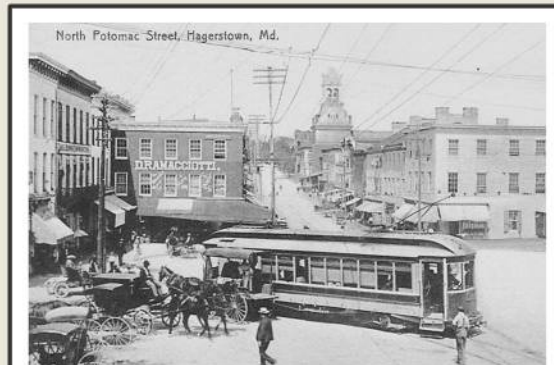
For decades, trolleys were a common sight at the intersection of Washington and Potomac Streets in downtown Hagerstown.

Frederick and Washington Counties are rich with history. The H&F Railway was a large part of that history; a part that the H&FRHS strives to preserve and promote.